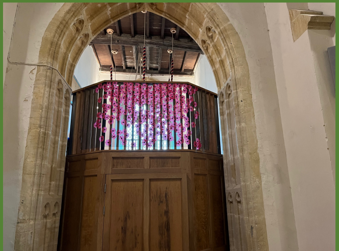
Askerswell's war memorial